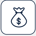
Lack of Capital